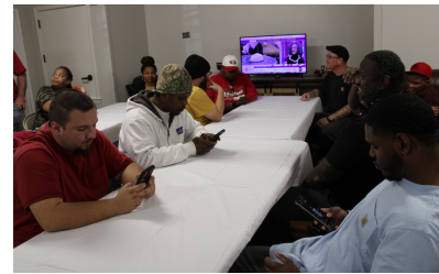
Maintenance and Transportation staff