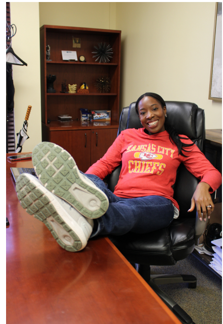
“Director for the Day”